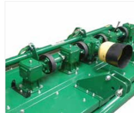
Heavy duty gearbox driven driveline