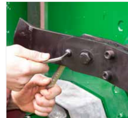
Two in one blade system, rigid and swinging