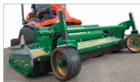
Cutting height adjustment system from 10 - 110mm