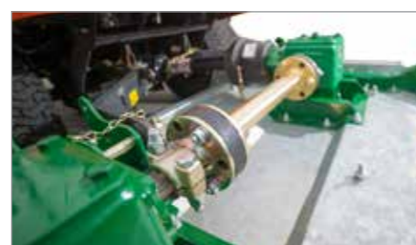
Robust construction and heavy duty gear-driven driveline