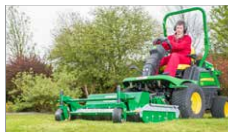
A professional finish in both heavy terrain and fine turf applications.

It is a flexible mower that delivers a professional finish in everyday grass mowing applications yet easily copes in much tougher mowing conditions.