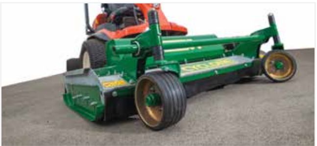
Cutting height adjustment system from 10 - 110mm