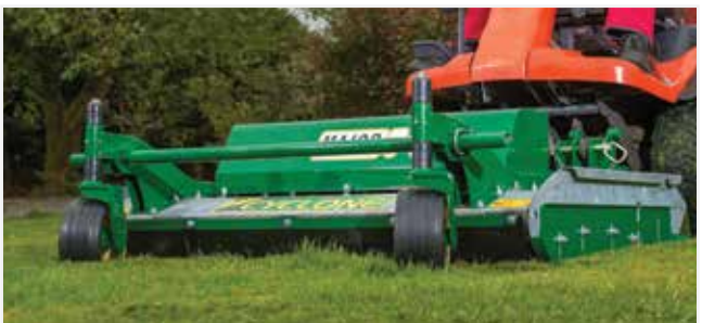
Heavy duty castor wheels