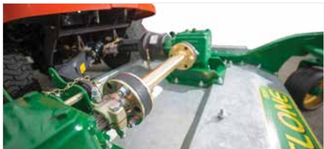
Robust construction and heavy duty geardriven driveline