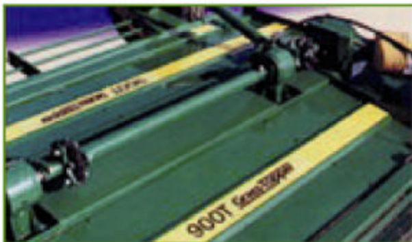
Option: Wide angle PTO shaft for 8FTGD & 9FTGD

The machine is afforded further protection by the rubber buffer and the high tension spring fitted to the drawbar. This system will dampen any of the shock loads the machine will encounter in the field or in transport to and from jobs.