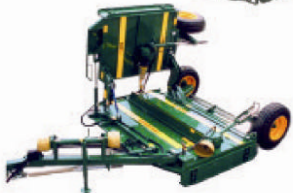
12FTGDW in operating and transport position