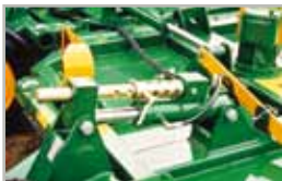
Simple height adjustment system for perfect cutting everytime