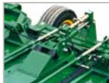
Maintenance free suspension removes shock loading & stress