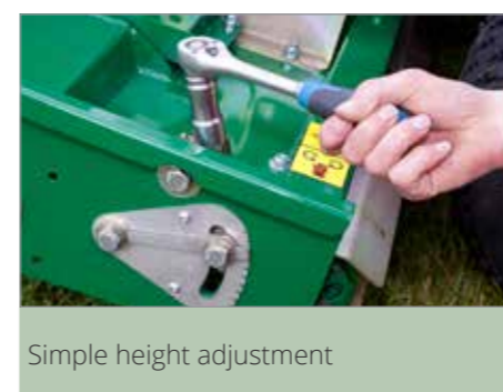
Simple height adjustment