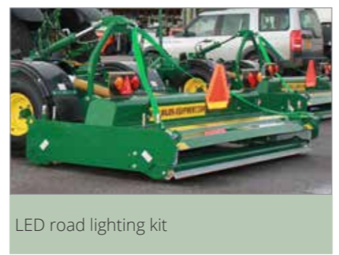
LED road lighting kit